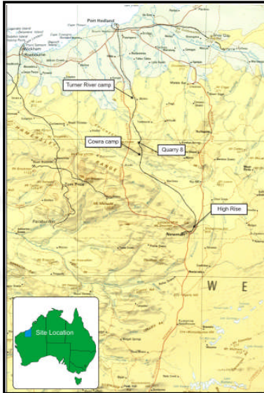
Part map